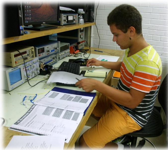
Pictured is an Electronics student busy doing an activity in the laboratory.

Mr. Phelps' students are pictured at left practicing how to coil and store cables. This is an important task for grips and camera operators to master.